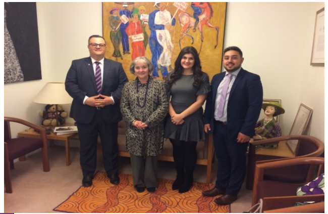
Representatives from Armenian National Congress to hear issues of concern to their local community